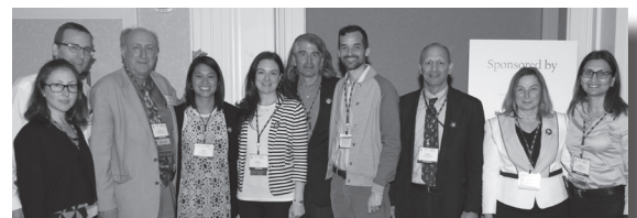
2015 Innovation award winners who have published on home based primary care in the past year.